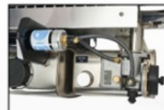
FUEL TANK & AIR FILTER