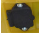
AM ZOOM-05 Charging socket