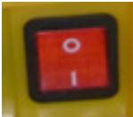
AM ZOOM-07 On/off switch