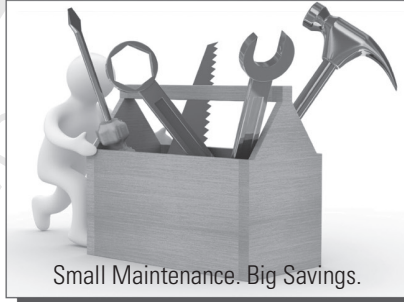
Small Maintenance. Big Savings.