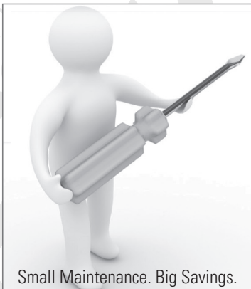
Small Maintenance. Big Savings.