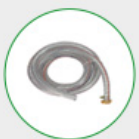
Suction Hose 4 Mtr.