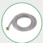
Overflow Hose 4 Mtr.