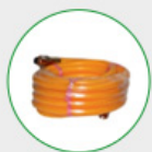
Delivery Hose - 8.5mm x 50mtr 2Nos.