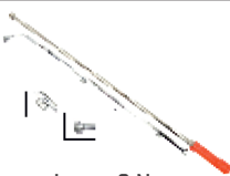
Lance 2 Nos.