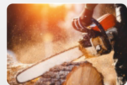
Saw the Tree