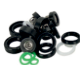
O Ring kit