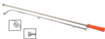
Lance 2 No.