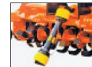
PTO SHAFT WITH OVERLOAD PROTECTION