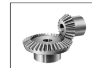
BEVEL GEAR EN353