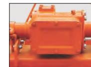
DUAL SPEED GEAR BOX