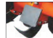
BORON STEEL BLADES