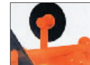
HARROW DISC (OPTIONAL)