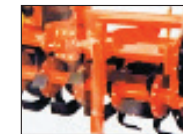
HELICAL ARRANGEMENT OF BLADES