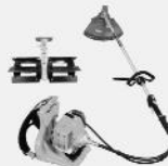
BRUSH CUTTER - BACK PACK