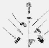
BRUSH CUTTER - MULTI TOOL