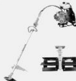
BACK PACK BC