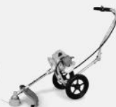
BRUSH CUTTER - PUSH TYPE