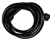
AM 405E-05 Hose