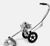
BRUSH CUTTER - PUSH TYPE