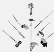
BRUSH CUTTER - MULTI TOOL