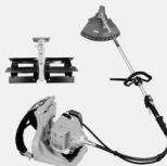
BRUSH CUTTER - BACK PACK