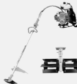
BACK PACK BC