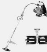
BACK PACK BC