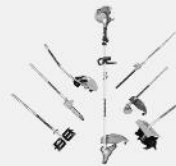
BRUSH CUTTER - MULTI TOOL